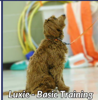
Luxie - Basic Training