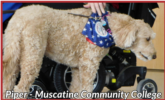
Piper - Muscatine Community College